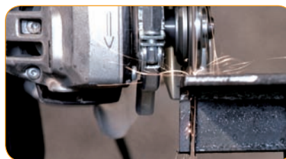
Versatile in application: even cuts steel