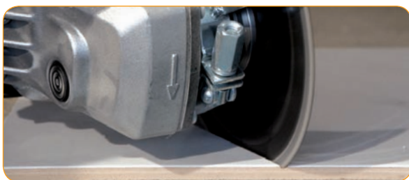
Cool and clean cut